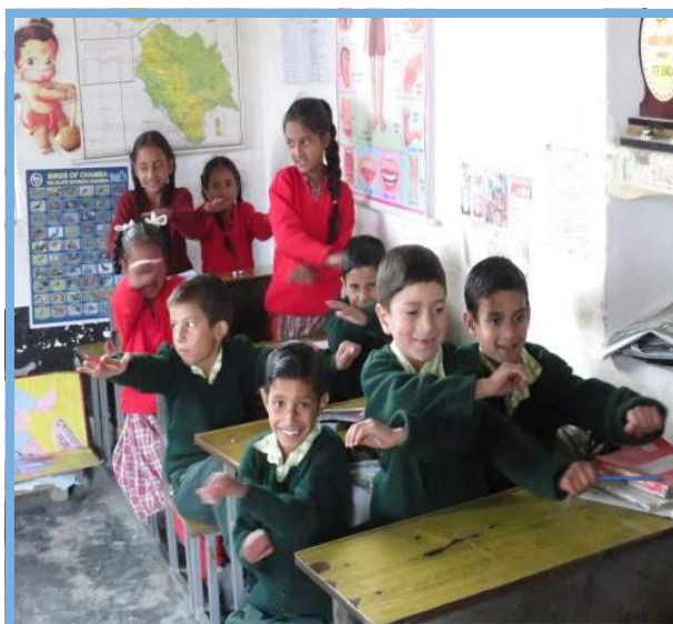
Dismissing unacceptable rules while discussing draft

rakhi on the trunks or branches of the trees. The aim of the activity is to create an emotional bond between the children and nature and inculcate in children the value of nature conservation.