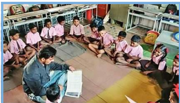
Language learning activity

As a first step, he began teaching students of class 1 keeping them interested with poems, stories, rhymes, alphabets in their local dialect