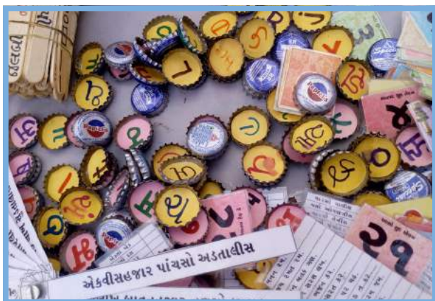
Badge for Literacy