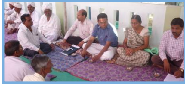
Recognising good work of SMC members

is actively supervising the reconstruction of the school's 146-year-old building, which involves the participation of about 3,000 people of the village. The children who were attending private schools in Palanpur came back to join the school in Kanodara.