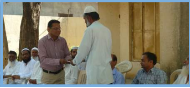
Recognising good work of SMC members